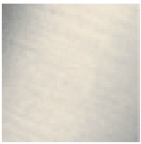
platinum matte 36 316 985-06

More custom finish options are available via special production (xTra Service). Please see our finish matrix for availability and pricing or contact a Dornbracht representative.